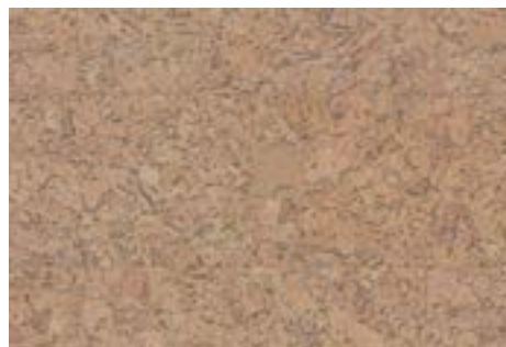
Alabaster Chalk TA10001 - 600 x 300 x 3,0mm Finishing: Varnish