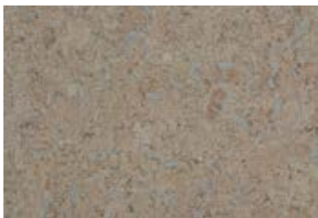
Hawai Black Platinum RY1H001 - 600 x 300 x 3,0mm Finishing: Wax