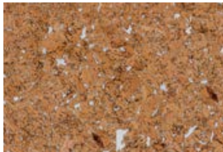
Hawai White RY77002 - 600 x 300 x 3,0mm Finishing: Wax

Combined with contrasting base colours, Hawai visuals are enhanced and get dressed with a more expressive fresh modern look.