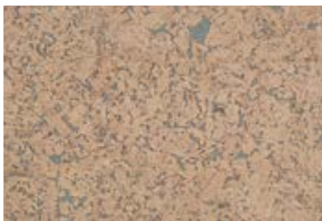
Hawai Black Oyster RY1G001 - 600 x 300 x 3,0mm Finishing: Wax