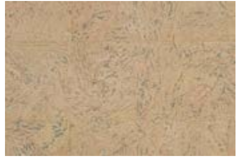
Piel Aqua RY11001 - 600 x 300 x 3,0mm Finishing: Wax