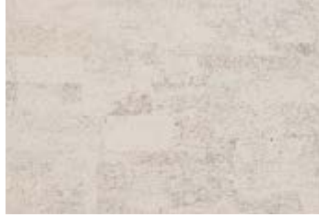
Malta Moonlight RY1N001 - 600 x 300 x 3,0mm Finishing: Wax