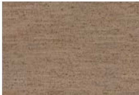
Bamboo Terra TA04001 - 600 x 300 x 3,0mm Finishing: Varnish