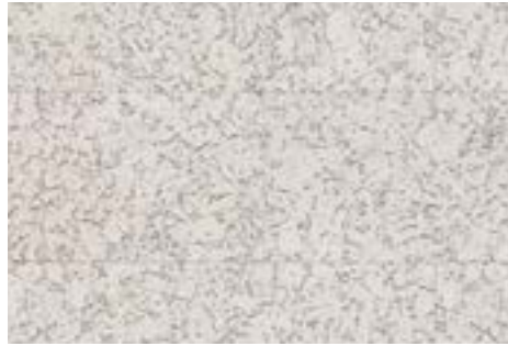
Hawai Exclusive RY77001 - 600 x 300 x 3,0mm Finishing: Wax