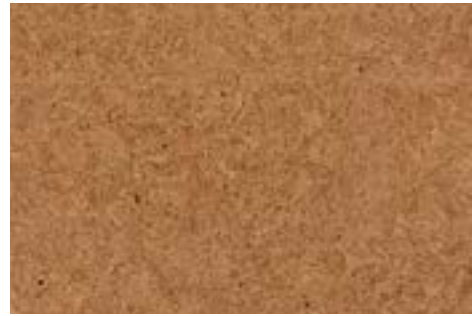
Cayman RY56001 - 600 x 300 x 3,0mm Finishing: Wax

The blended design of Cayman was created to infuse a warm touch of natural serenity into interior decors. The small organic forms of cork, appeal to our senses and capture the cosy essence of nature.