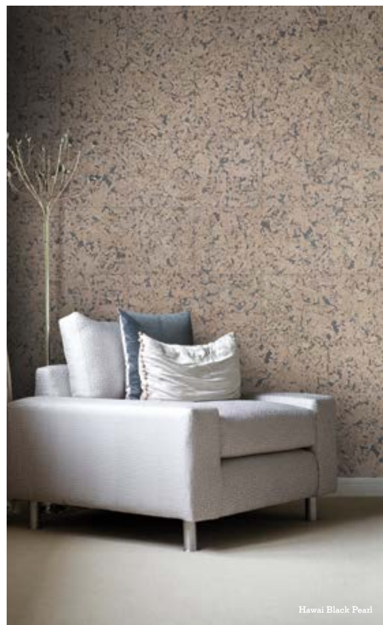
Hawai Black Pearl