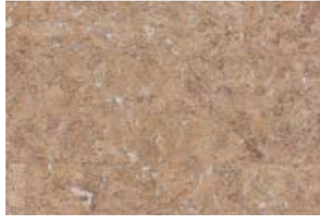
Alabaster Cream TA11001 - 600 x 300 x 3,0mm Finishing: Varnish