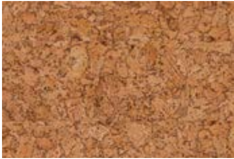
Hawai Natural RY11001 - 600 x 300 x 3,0mm Finishing: Wax