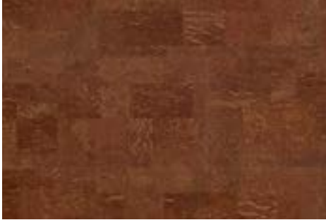
Malta Chestnut RY1L001 - 600 x 300 x 3,0mm Finishing: Wax

A traditional look with modern colors and state of the art technology was the perfect combination to create this contemporary new collection. Malta is very versatile: it gives tastefulness to a modern ambiance and brings sophistication to a simple décor.