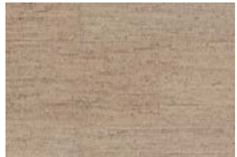
Bamboo Artica TA01001 - 600 x 300 x 3,0mm Finishing: Varnish