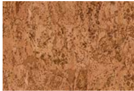
Fiord Natural RY15001 - 600 x 300 x 3,0mm Finishing: Wax