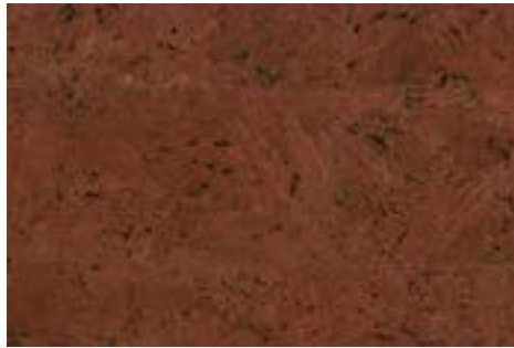
Piel Nut RY11001 - 600 x 300 x 3,0mm Finishing: Wax