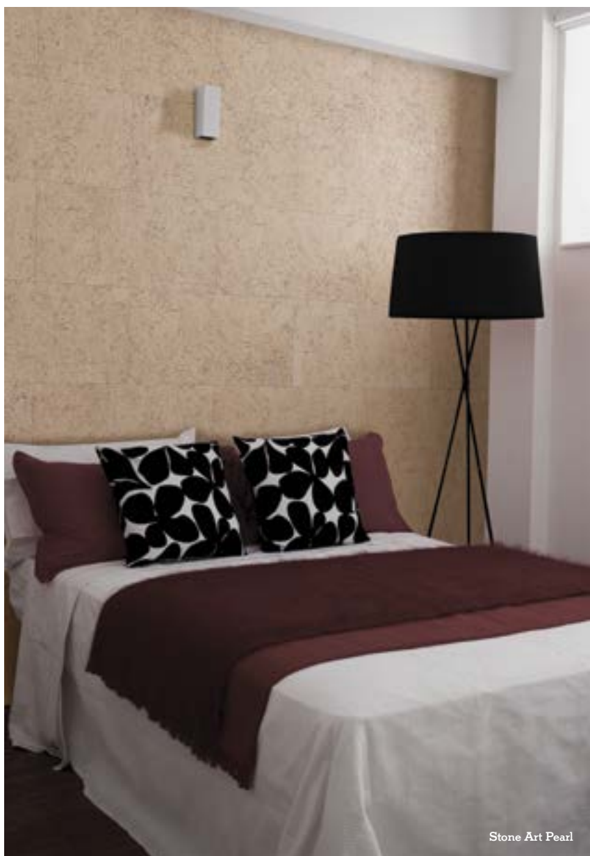
Stone Art Pearl

TA24001 - 600 x 300 x 3,0mm Finishing: Varnish