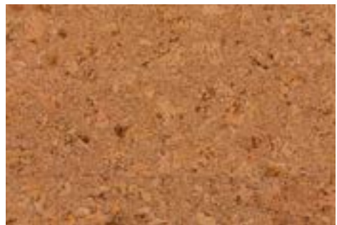
Melville RY40001 - 600 x 300 x 3,0mm Finishing: Wax

Based on a refined cork visual, Melville is the ideal choice if you are aiming for timeless beauty. Rustic designs are trending in modern interior decoration, and Melville results in an inviting and captivating atmosphere.