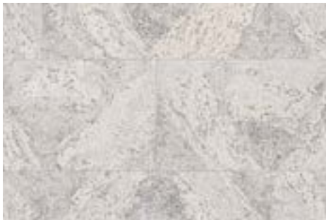
Flores White RY07001 - 600 x 300 x 3,0mm Finishing: Wax