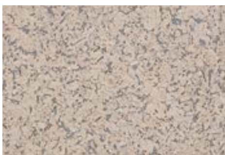
Hawai Black Pearl RY1F001 - 600 x 300 x 3,0mm Finishing: Wax