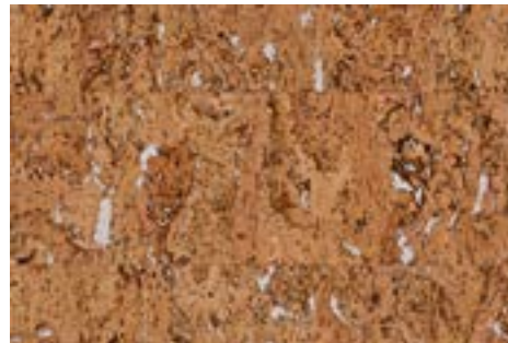
Fiord White RY19001 - 600 x 300 x 3,0mm Finishing: Wax