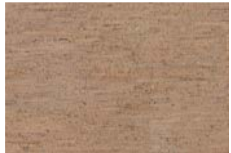
Bamboo Toscana TA05001 - 600 x 300 x 3,0mm Finishing: Varnish