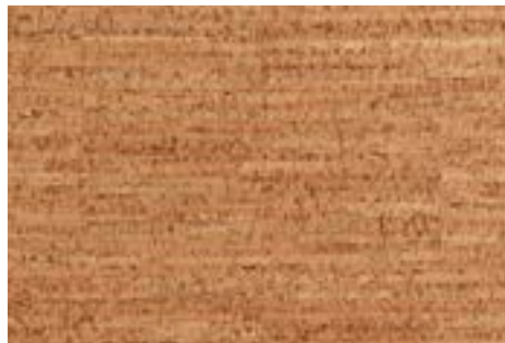
Bali RY48001 - 600 x 300 x 3,0mm Finishing: Wax