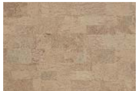
Malta Champagne RY1M001 - 600 x 300 x 3,0mm Finishing: Wax