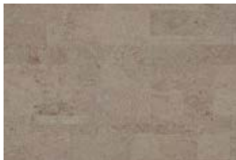
Malta Platinum RY1K001 - 600 x 300 x 3,0mm Finishing: Wax