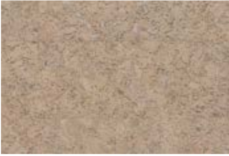
Alabaster Porcelain TA12001 - 600 x 300 x 3,0mm Finishing: Varnish