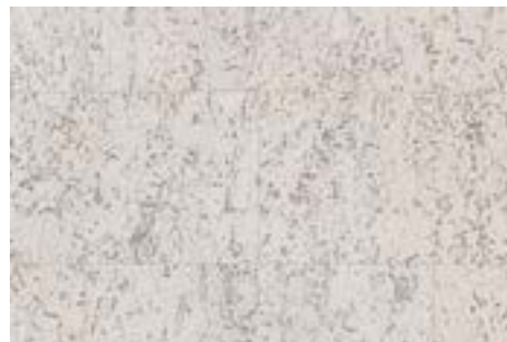
Fiord Exclusive RY19002 - 600 x 300 x 3,0mm Finishing: Wax